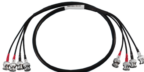
bnc-bnc Extender Cable, 1 m bnc-bnc Extender Cable, 2 m