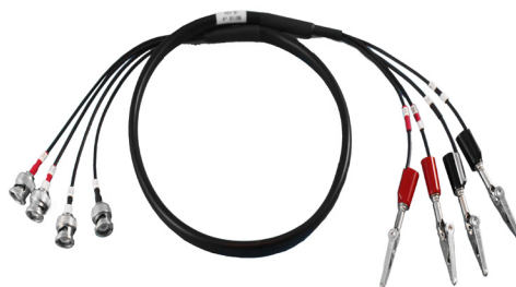
Alligator Clip Leads

Rack Mount Kit 2000-16 RS232-to-USB Adapter 630250