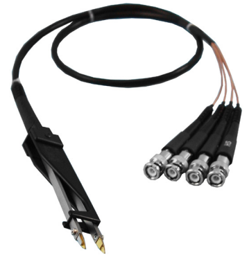
Chip Component Tweezers